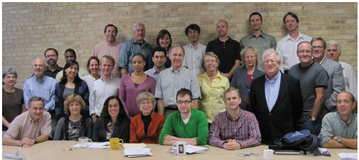
Psychology Department Faculty