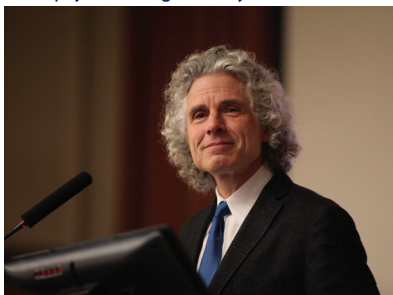
Steven Pinker spoke at NU on February 20